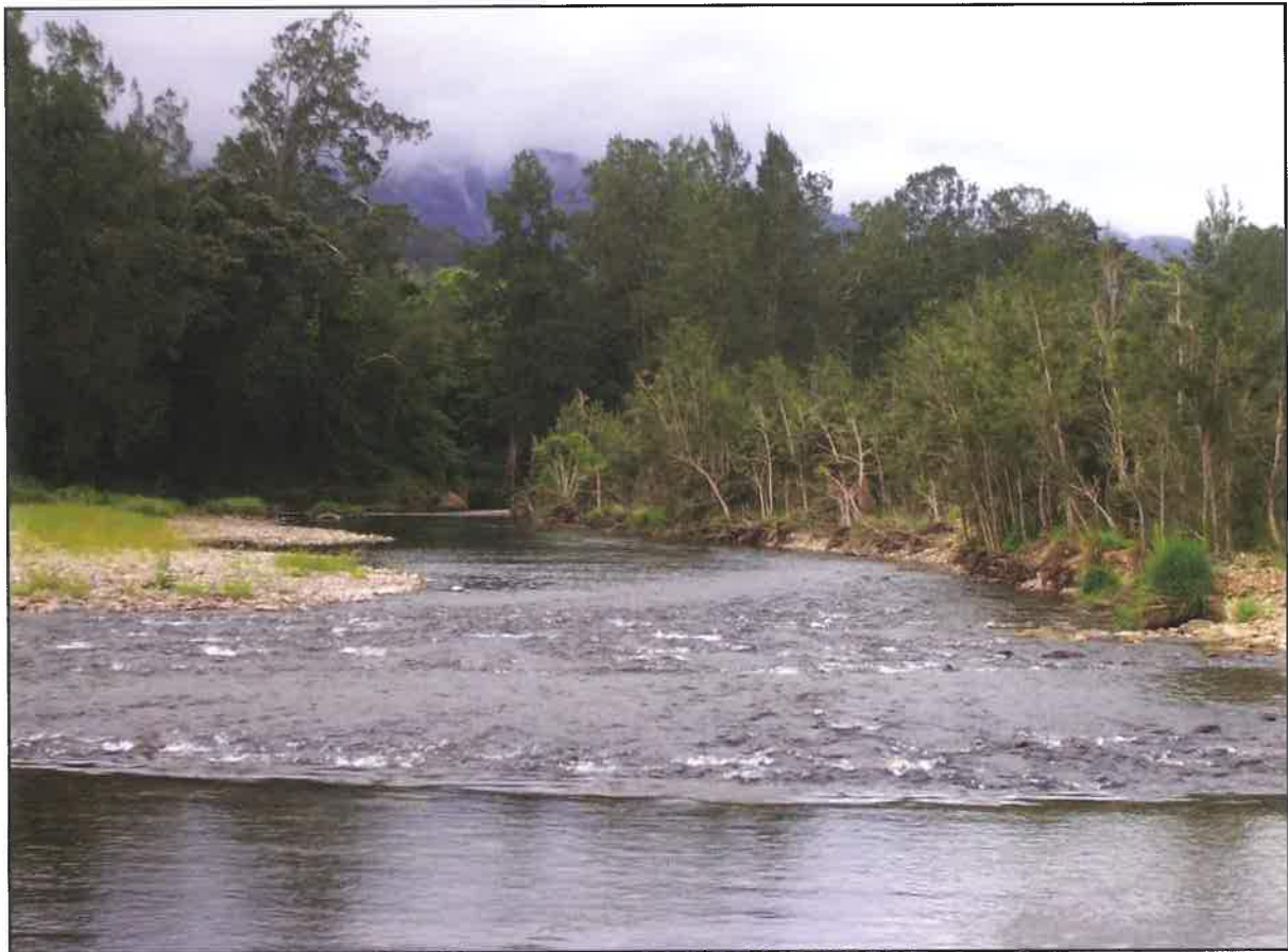
River oaks at Gordonville Crossing on the Bellingher River

River oaks have always been part of the riverine landscape of the mid-north coast of New South Wales. Early settlers' notes suggest that vegetation grew in the river as well as on the floodplain when these valleys were first surveyed. These river oaks would have grown as emergent species within the floodplain forest and as colonisers on gravel bars. Today, river oaks are more common and numerous, and this increase is largely due to an increase in suitable habitat. This has led to the need for their management in some situations.