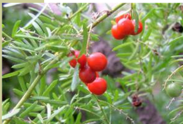
Plant with mature fruit